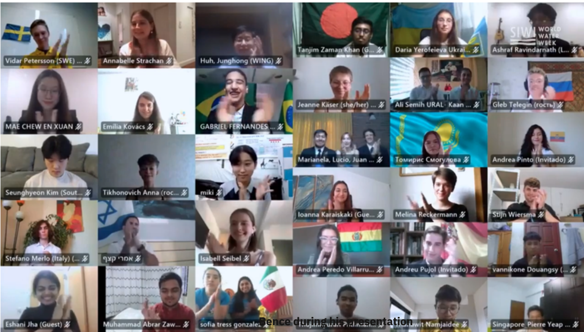
Finalists waiting for the Award Ceremony