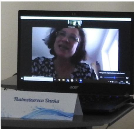
The jury of the SJWP – Hungary 2018

During the final, the contestants presented their main findings and answered the jury's questions. Approximately 15 minutes per team were allocated. The presentations and the interviews were conducted in English.