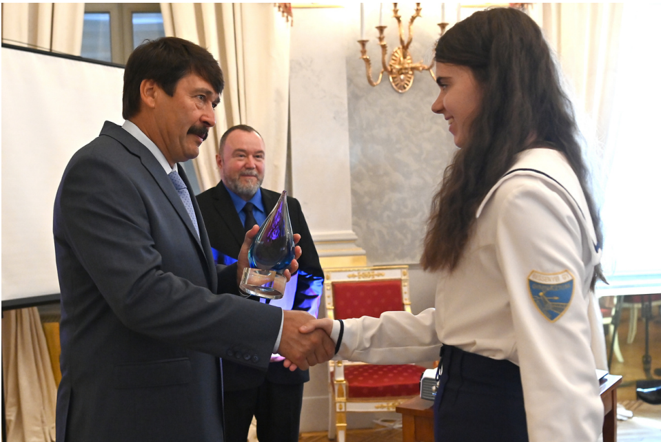
The winner of the SJWP Hungary 2021 receiving the prize from President János Áder

For the official Award Ceremony of the 2021 Hungarian SJWP competition President János Áder invited the five finalist teams to his office. There the students shortly explained their results to the President in the presence of the media. Mr. Áder handed over the SJWP 2021 Hungary Prize to the winner.