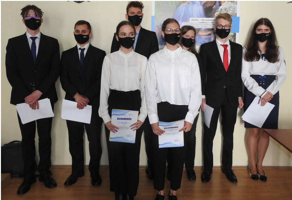
Finalists of the national contest