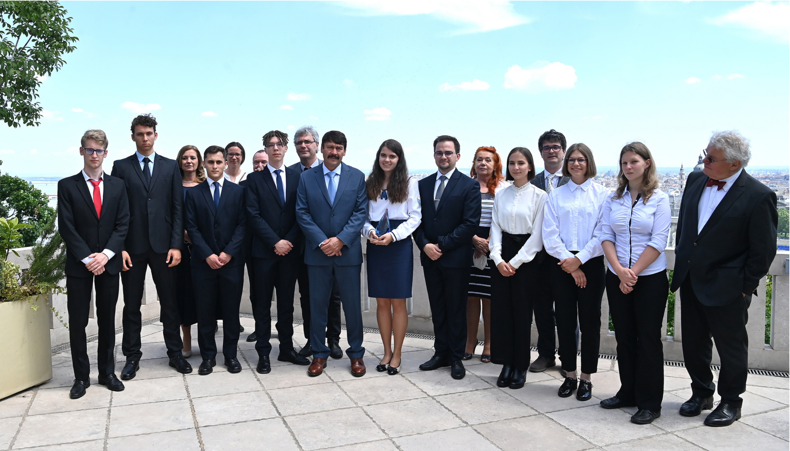
Finalists and their teachers with President Áder on the balcony of Sándor Palace